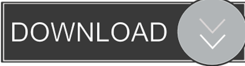
Pepp 1992 Preescolar Pdf 14